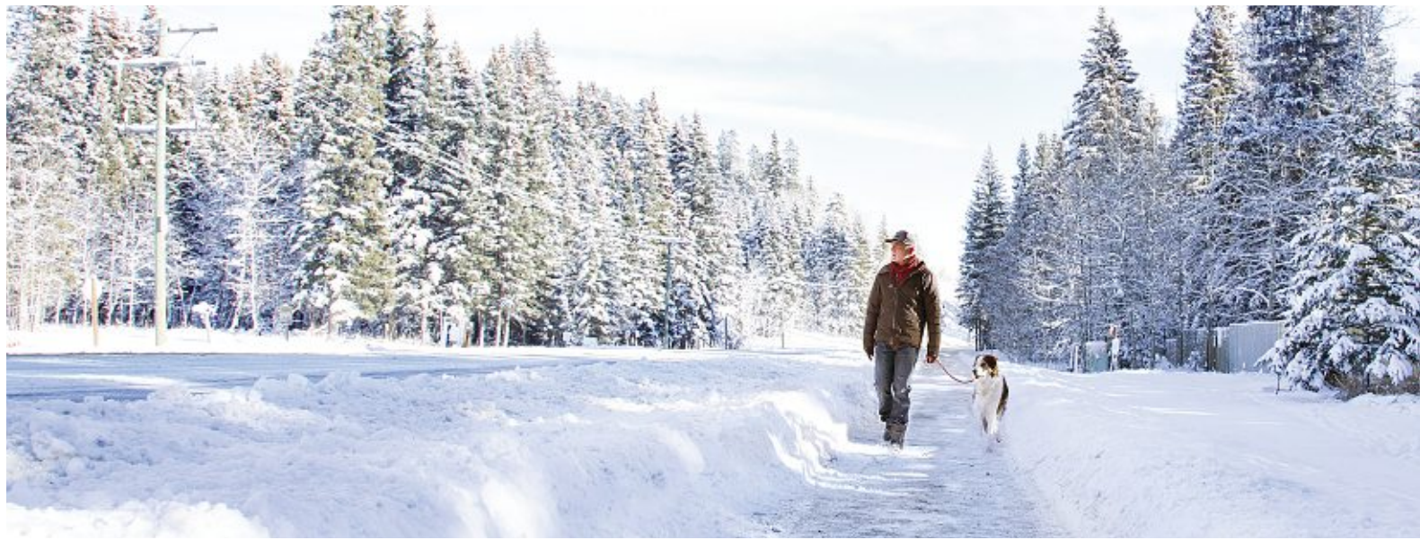
The Greater Bragg Creek Trails Association is fundraising to complete its Trans Canada Trail Project next summer.

Donations surpassing the $150,000 goal of the Bragg Creek Trans Canada Trail Project will be applied to future trail projects.