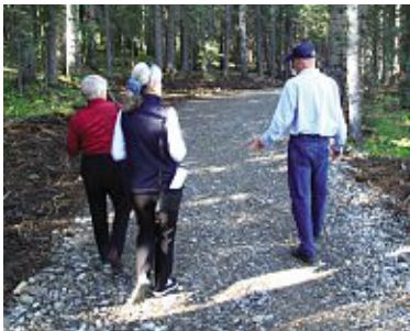
Trails around Bragg Creek offer all kinds of recreation possibilities.

“This trail is important because it connects Calgary, Bragg Creek, Canmore and Banff; making our neighbouring communities part of the Trans Canada Trail legacy,” says Greater Bragg Creek Trails